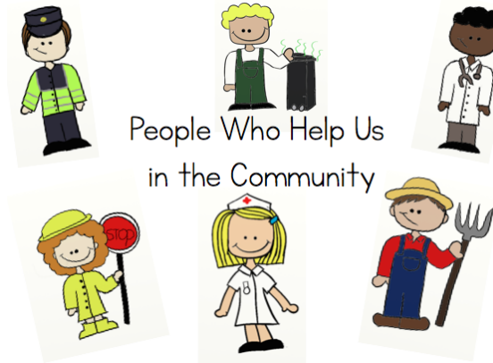
People Who Help Us in the Community